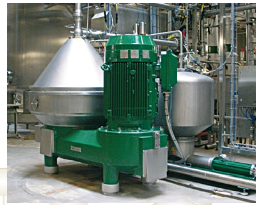
top: beer dealcoholization bottom: separator