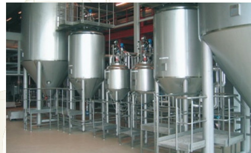
top: ECO-MATRIX™ bottom: yeast management YEAST-STAR™