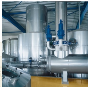
top: wort boiling bottom: energy recovery