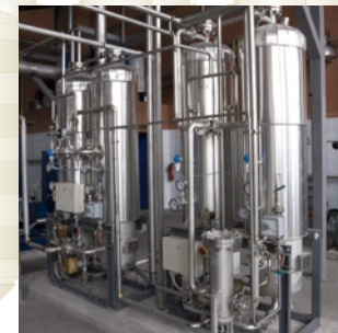
top: water deaeration DIOX™ bottom: CO 2 recovery